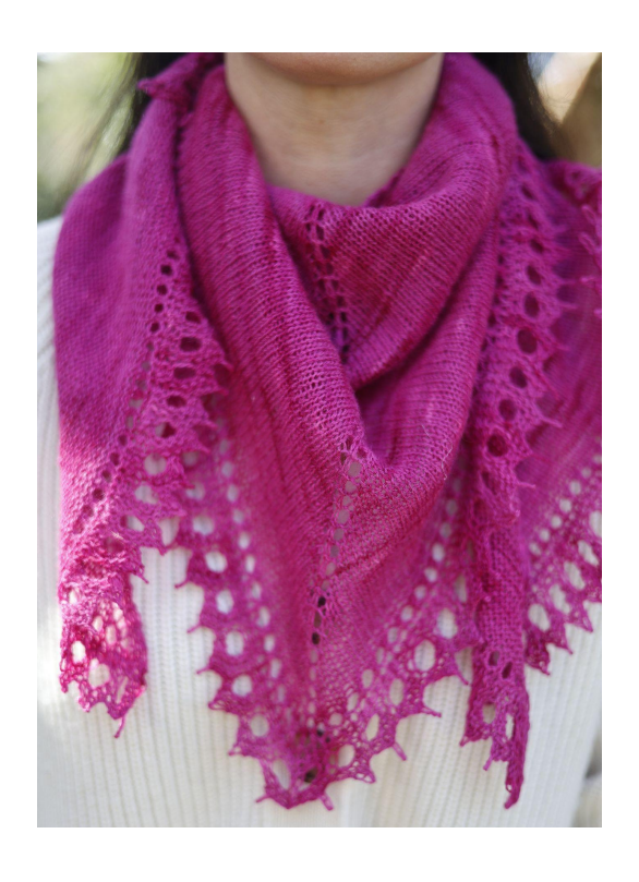
kirstenjoel.com All text, images, & illustrations ©2023 Kirsten Joel For personal use only