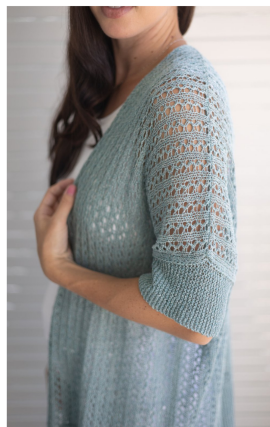
RINCON CAFTAN cardigans