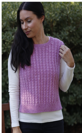
YOUR SLIPOVER tops