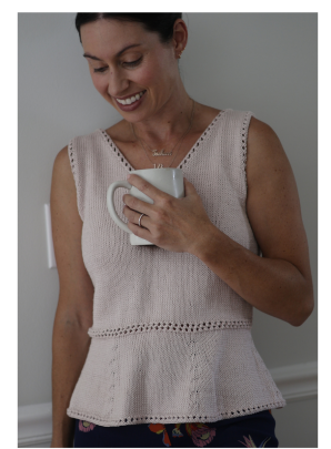
SISTER PEPLUM RINCON CAFTAN