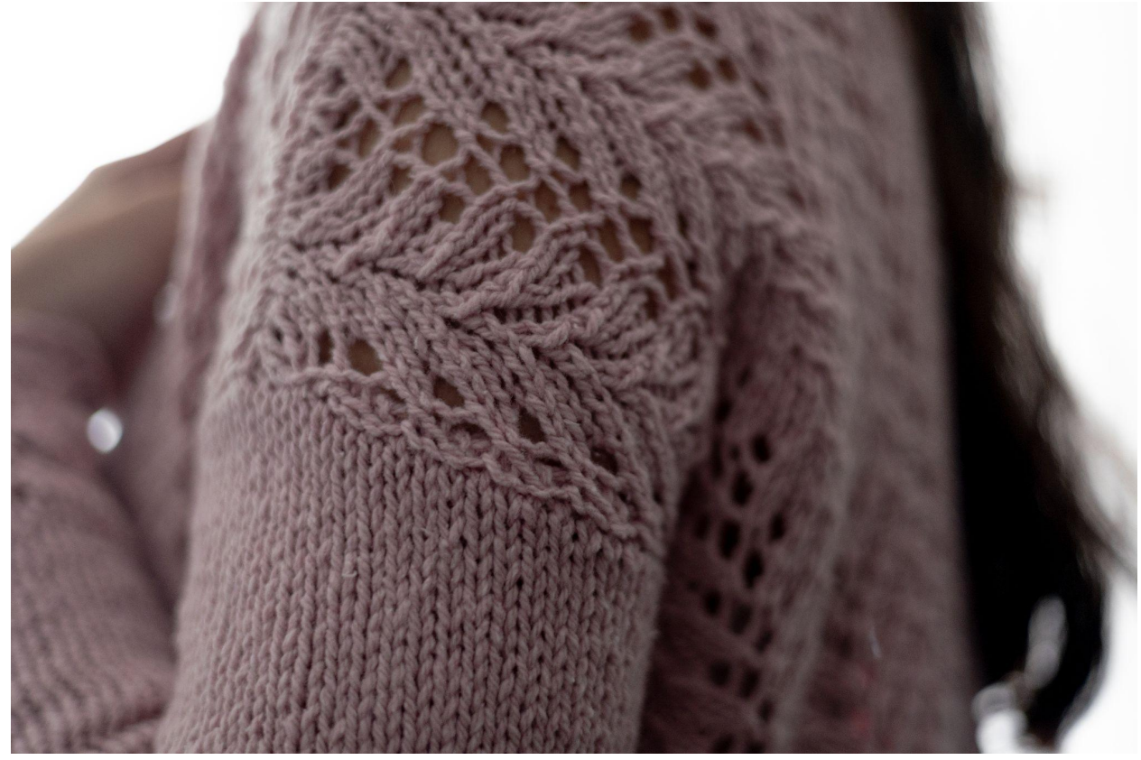
kirstenjoel.com All text, images, & illustrations ©2023 Kirsten Joel For personal use only