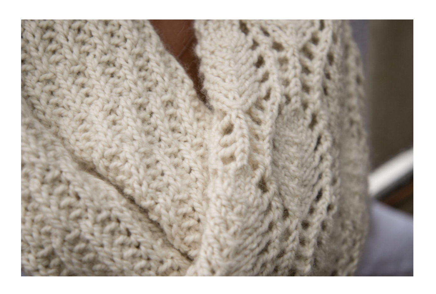
CHART INSTRUCTIONS TRELLIS LACE STITCH (multiple of 12 sts + 17) Note: All WS rows are worked as K1 * purl to last st, k1